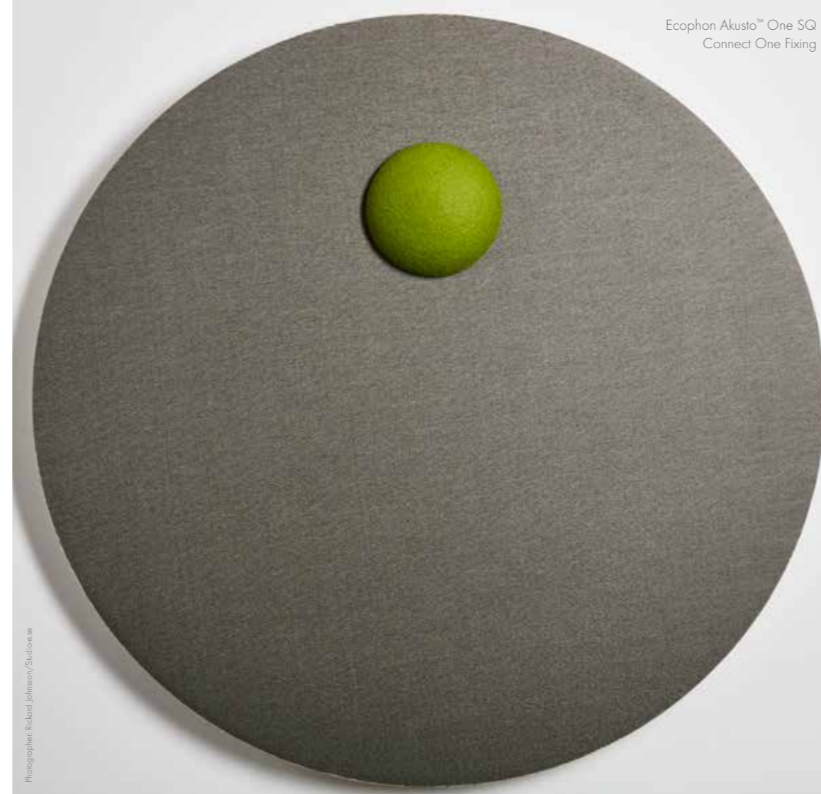
Ecophon Akusto™ One SQ Connect One Fixing

Connect Channel Trim is an easy and functional solution for Ecophon Akusto™ Wall A. Use Connect T24 Main Runners or Connect Recessed Profiles between the panels. Using the recessed profile also gives you the opportunity to add shelves and use the installation as a bookcase.