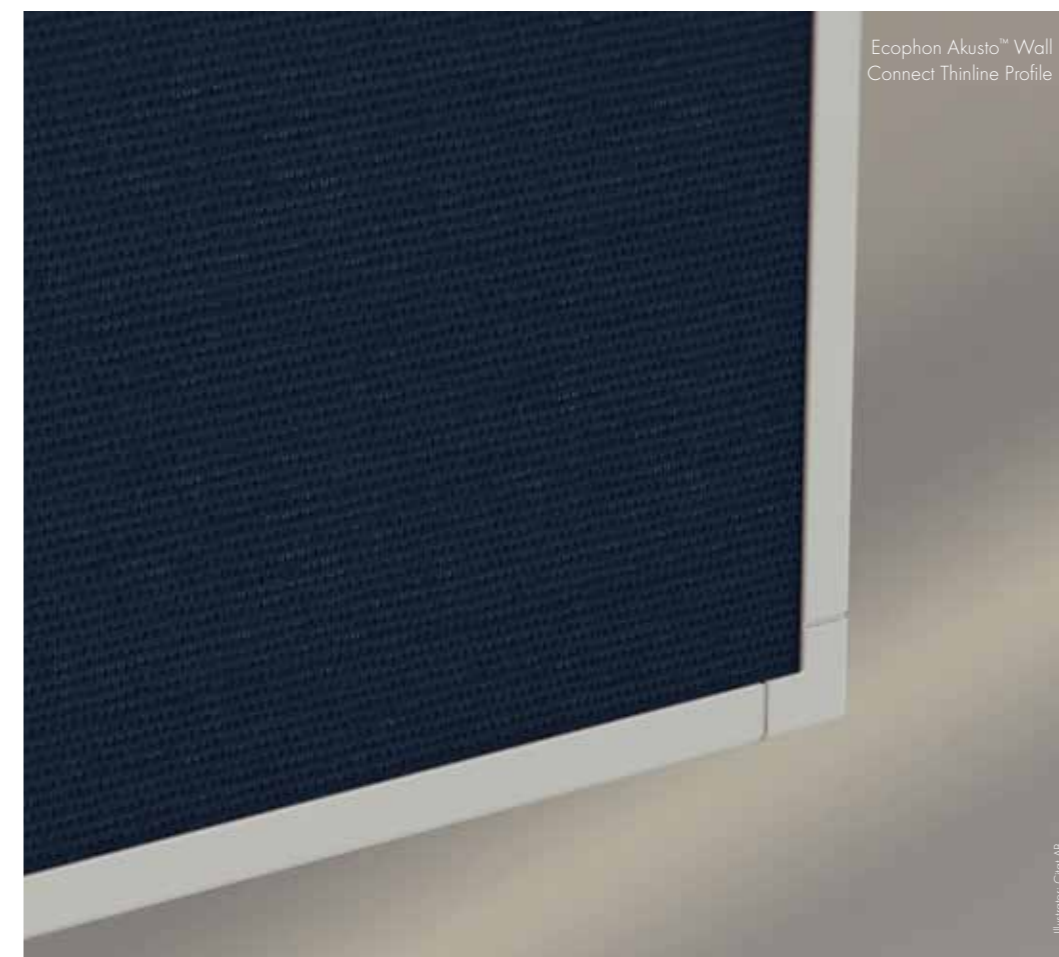
Ecophon Akusto™ Wall Connect Thinline Profile