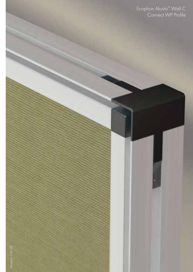
Ecophon Akusto™ Wall C Connect WP Profile