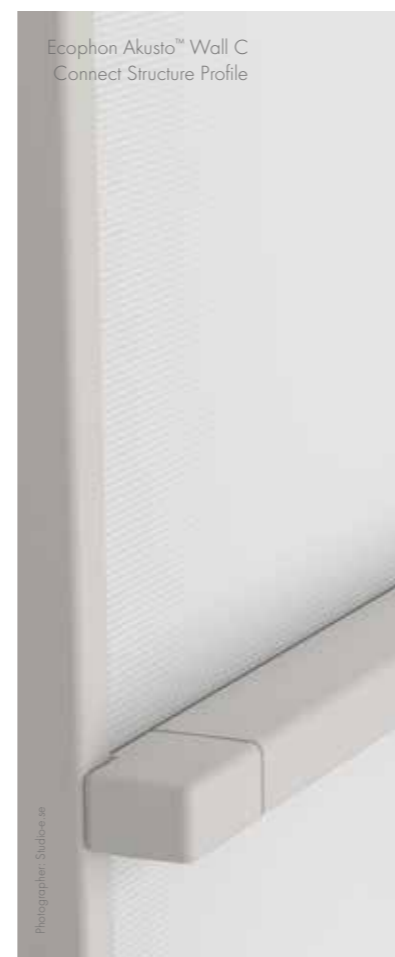
Ecophon Akusto™ Wall C Connect Structure Profile