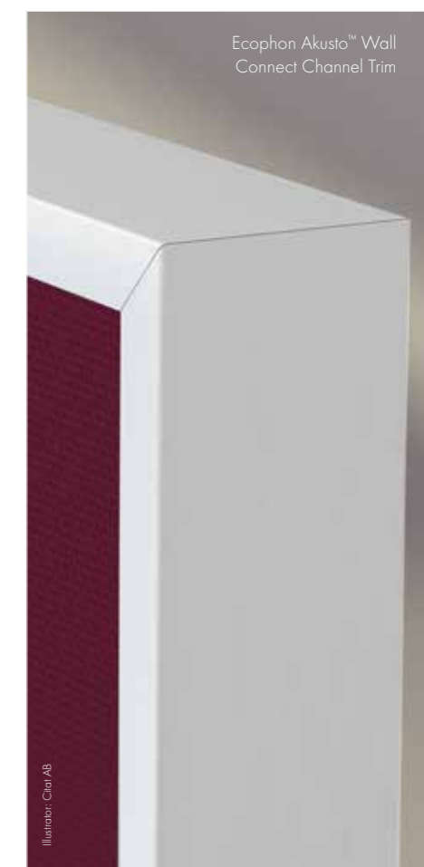
Ecophon Akusto™ Wall Connect Channel Trim